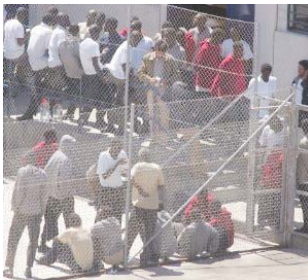
People detained and deprived of freedom for not having committed any criminal act.